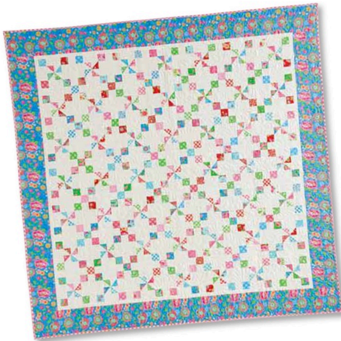
Sugarplums 84½" x 84½" quilt is patterned in the December/January 2013 issue of McCall's Quick Quilts.